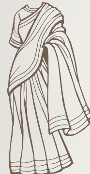
SAREE DRAPING / LEHENGA

FOR OUR BELOVED OVERSEAS WEDDING CLIENTS, WE PROUDLY PRESENT OUR EXCLUSIVE AIRBRUSH PACKAGE. THE ADDITIONAL COST REFLECTS OUR COMMITMENT TO DEDICATING OUR ENTIRE TEAM SOLELY TO YOU ON YOUR BIG DAY, ENSURING UNMATCHED PERSONALIZED SERVICE AND ATTENTION. WE USE ONLY PREMIUM INTERNATIONAL PRODUCTS, CHOSEN TO GIVE YOU A FLAWLESS AND LONG-LASTING FINISH THAT COMPLEMENTS YOUR CELEBRATION.