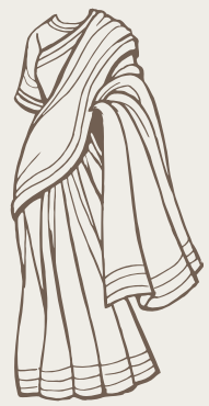
SAREE DRAPING / LEHENGA

TAILORED FOR EVERY OCCASION BRIDESMAID MAKEUP OFTEN EMBRACES CREATIVITY, FEATURING BOLD COLORS AND TRENDY STYLES THAT FIT PERFECTLY WITH THE LIVELY ATMOSPHERE OF THE CELEBRATION. AT OUR STUDIO, WE SPECIALIZE IN BOTH BRIDAL AND PARTY MAKEUP, PROVIDING TAILORED LOOKS THAT CATER TO THE UNIQUE NEEDS OF EACH OCCASION.